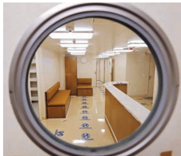
The interior decoration work of the "Adora Magic City" is now under way.